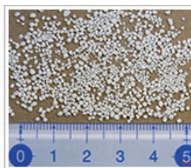
G L - 015