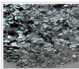
waste glass material