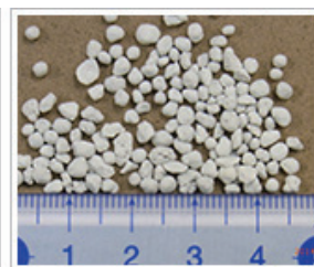
G L - 030